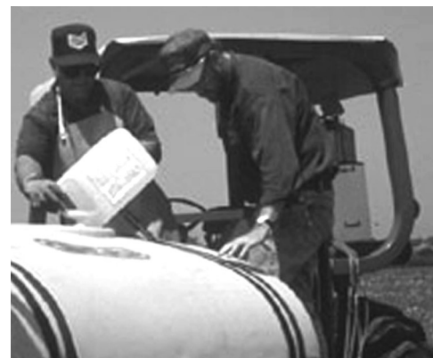
A noncertified applicator must be supervised during mixing and loading of restricted-use pesticides.

Making a pesticide application for payment (using restricted-use products or not) requires commercial Category 1a (ag plant pest control) certification, a business license, and proof of insurance. For more information on obtaining a business license, go to the pesticide section of the OISC Website, < http://www.isco.purdue.edu/index_pest.html >; or call 765/494-1594.